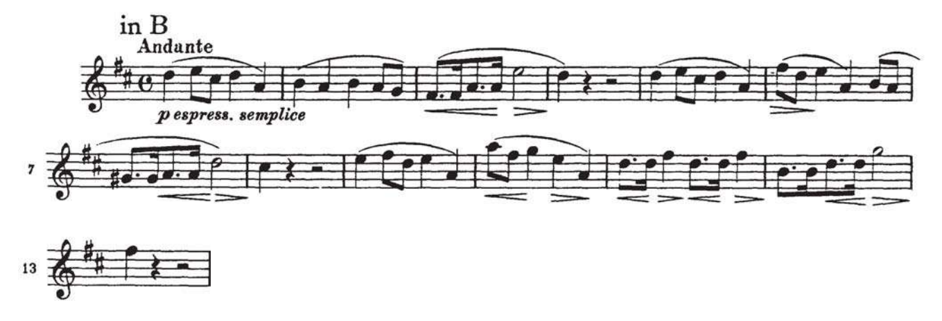
Wagner, Elsa's Procession to the Cathedral (in Bb)